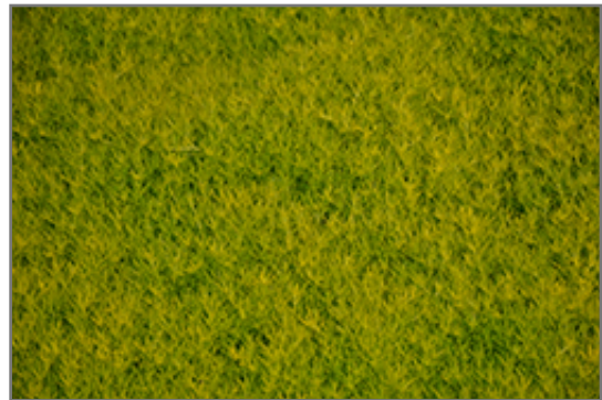
Scotch Moss foliage