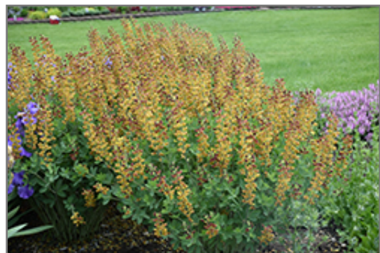
Decadence Cherries Jubilee False Indigo in bloom