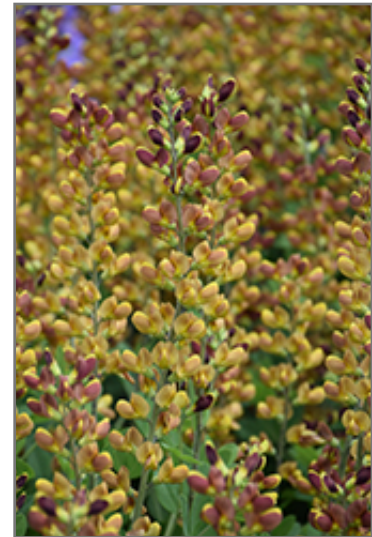
Decadence Cherries Jubilee False Indigo flowers

This is a relatively low maintenance plant, and is best cleaned up in early spring before it resumes active growth for the season. It is a good choice for attracting bees and butterflies to your yard, but is not particularly attractive to deer who tend to leave it alone in favor of tastier treats. It has no significant negative characteristics.