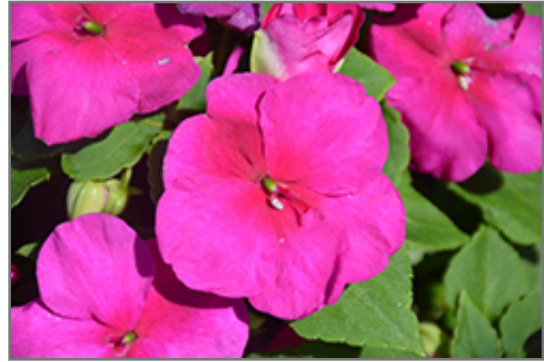
Super Elfin Ruby Impatiens in bloom