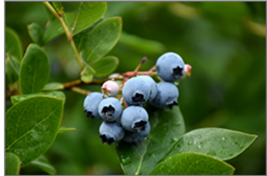
Northcountry Blueberry fruit

Northcountry Blueberry features dainty clusters of white bell-shaped flowers with shell pink overtones hanging below the branches in mid spring. It has green deciduous foliage. The glossy oval leaves turn an outstanding scarlet in the fall. It features an abundance of magnificent blue berries in mid summer.