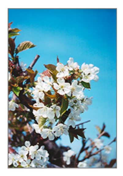
Bing Cherry flowers