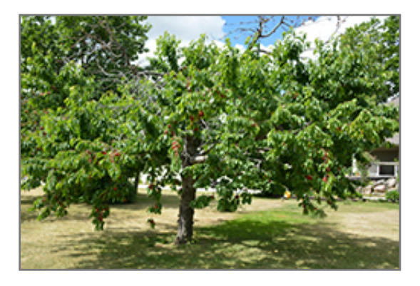
Bing Cherry fruit

This is a deciduous tree with a shapely oval form. Its average texture blends into the landscape, but can be balanced by one or two finer or coarser trees or shrubs for an effective composition. This plant will require occasional maintenance and upkeep, and is best pruned in late winter once the threat of extreme cold has passed. It is a good choice for attracting birds to your yard. Gardeners should be aware of the following characteristic(s) that may warrant special consideration;