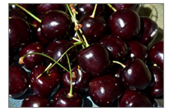
Bing Cherry fruit