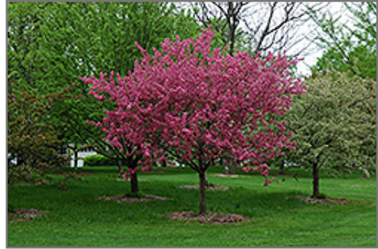
Prairifire Flowering Crab in bloom

This tree will require occasional maintenance and upkeep, and is best pruned in late winter once the threat of extreme cold has passed. It has no significant negative characteristics.