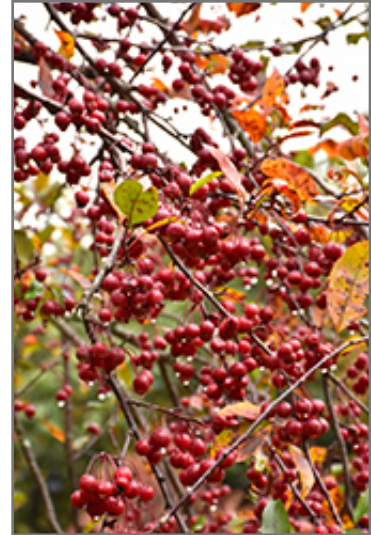
Prairifire Flowering Crab fruit

This tree should only be grown in full sunlight. It prefers to grow in average to moist conditions, and shouldn't be allowed to dry out. It is not particular as to soil type or pH. It is highly tolerant of urban pollution and will even thrive in inner city environments. This particular variety is an interspecific hybrid.