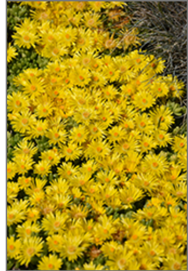
Yellow Ice Plant flowers

Yellow Ice Plant is recommended for the following landscape applications;