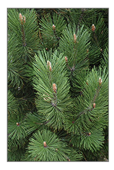
Emerald Arrow Bosnian Pine foliage

Wasco Nursery & Garden Center 41W781 Route 64, St. Charles, IL, 60175 phone: 630.584.4424 www.wasconursery.com sales@wasconursery.com