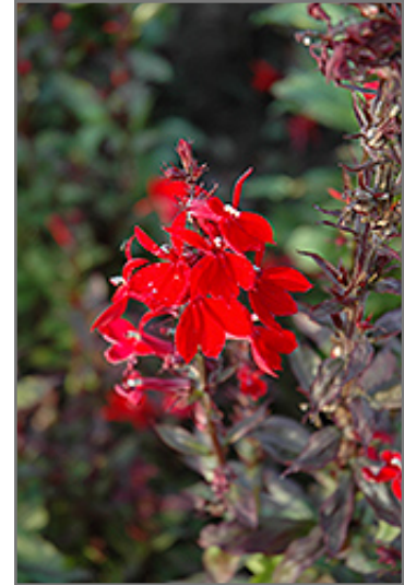
Queen Victoria Lobelia flowers