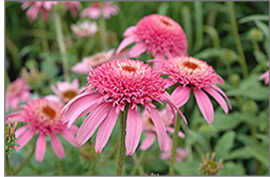
Cone-fections Pink Double Delight Coneflower flowers

This is a relatively low maintenance plant, and is best cleaned up in early spring before it resumes active growth for the season. It is a good choice for attracting butterflies to your yard, but is not particularly attractive to deer who tend to leave it alone in favor of tastier treats. It has no significant negative characteristics.