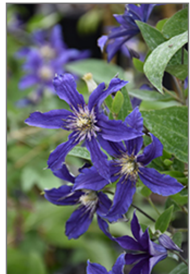
Sapphire Indigo Clematis flowers