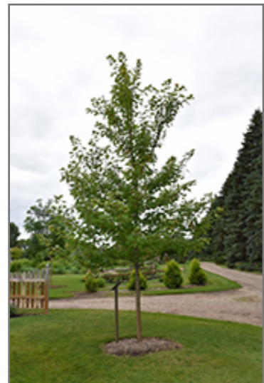
Matador Maple