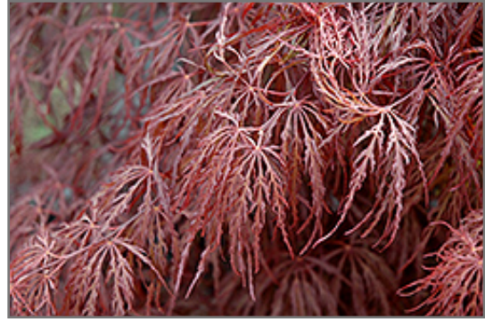
Crimson Queen Japanese Maple foliage

Crimson Queen Japanese Maple is recommended for the following landscape applications;