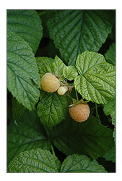
Fall Gold Raspberry fruit

Wasco Nursery & Garden Center 41W781 Route 64, St. Charles, IL, 60175 phone: 630.584.4424 www.wasconursery.com sales@wasconursery.com