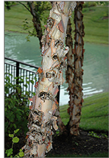
River Birch bark