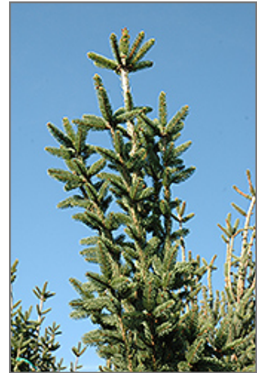
Columnar Norway Spruce foliage