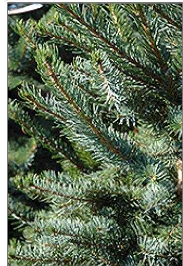
Bruns Spruce foliage