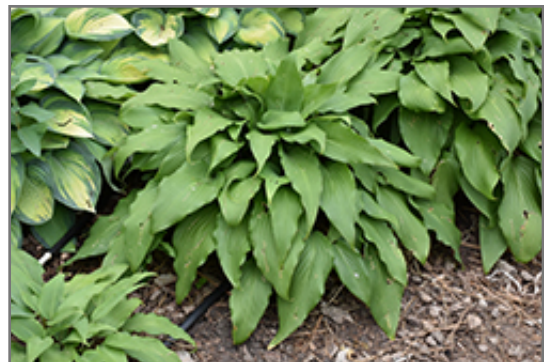
Red October Hosta