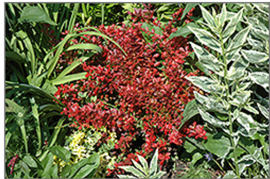
Cherry Bomb Japanese Barberry