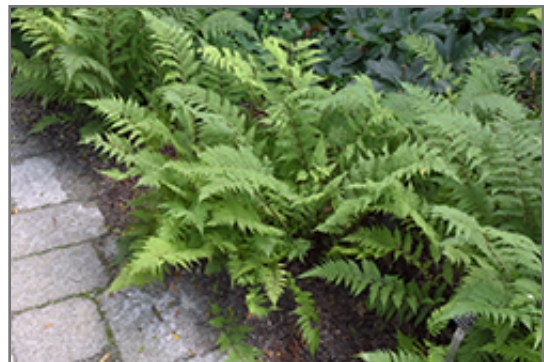
Lady in Red Fern