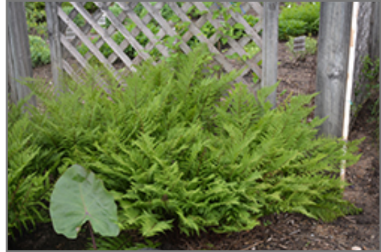
Lady in Red Fern

This plant does best in partial shade to shade. It prefers to grow in moist to wet soil, and will even tolerate some standing water. It is particular about its soil conditions, with a strong preference for rich, acidic soils. It is somewhat tolerant of urban pollution, and will benefit from being planted in a relatively sheltered location. Consider applying a thick mulch around the root zone over the growing season to conserve soil moisture. This is a selected variety of a species not originally from North America, and parts of it are known to be toxic to humans and animals, so care should be exercised in planting it around children and pets. It can be propagated by division; however, as a cultivated variety, be aware that it may be subject to certain restrictions or prohibitions on propagation.