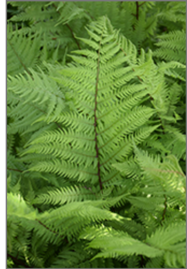
Lady in Red Fern foliage

Lady in Red Fern is recommended for the following landscape applications;