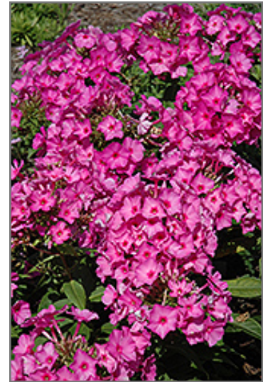
Pink Flame Garden Phlox flowers

Pink Flame Garden Phlox is recommended for the following landscape applications;