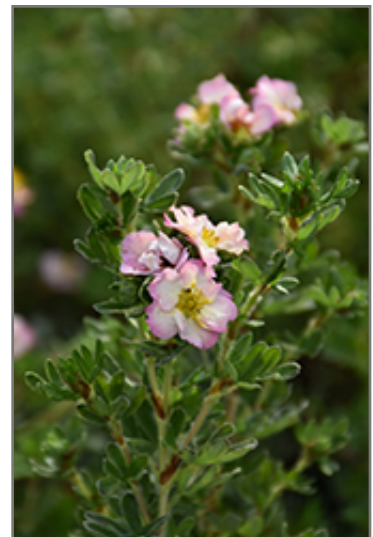
Happy Face Hearts Potentilla flowers