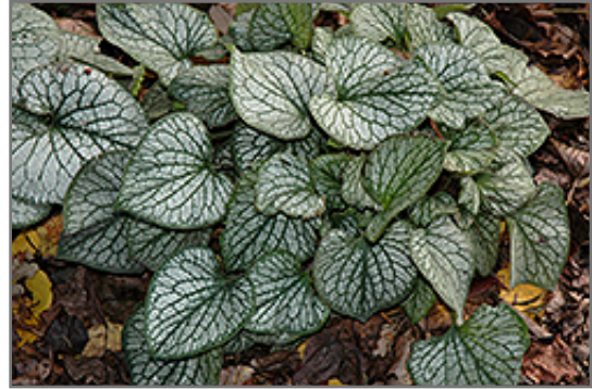
Jack Frost Bugloss