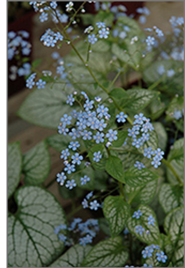
Jack Frost Bugloss flowers

Jack Frost Bugloss is a fine choice for the garden, but it is also a good selection for planting in outdoor pots and containers. It is often used as a 'filler' in the 'spiller-thriller-filler' container combination, providing a mass of flowers and foliage against which the thriller plants stand out. Note that when growing plants in outdoor containers and baskets, they may require more frequent waterings than they would in the yard or garden.