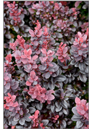
Concorde Japanese Barberry foliage

Concorde Japanese Barberry is recommended for the following landscape applications;