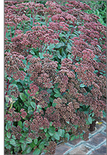
Matrona Stonecrop flowers

Matrona Stonecrop is recommended for the following landscape applications;