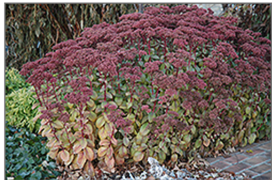
Matrona Stonecrop in fall