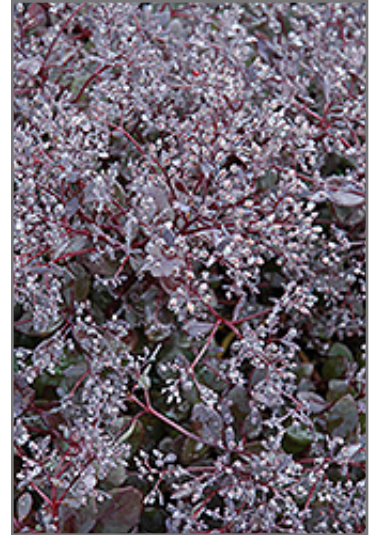
Bertram Anderson Stonecrop flowers

Bertram Anderson Stonecrop is recommended for the following landscape applications;