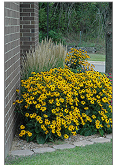
Goldsturm Coneflower in bloom