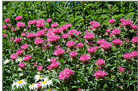
Marshall's Delight Beebalm flowers