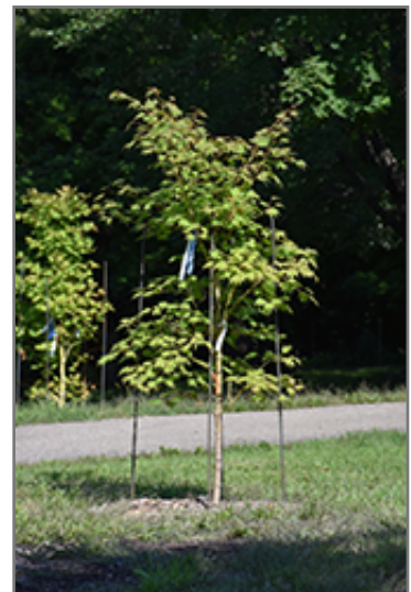
Jack Frost Arctic Jade Maple