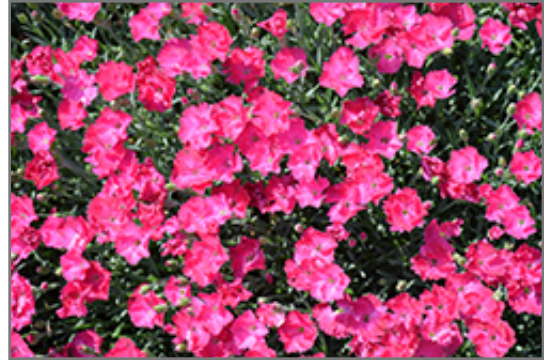
Paint The Town Magenta Pinks flowers