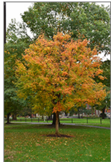
Three Flowered Maple in fall