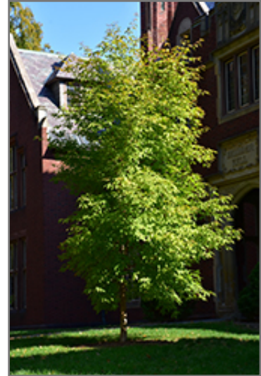
Three Flowered Maple