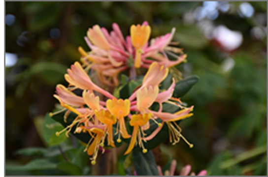
Goldflame Honeysuckle flowers