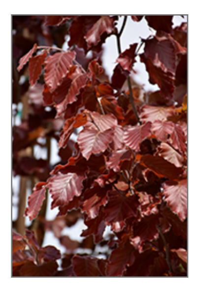
Red Obelisk Beech foliage