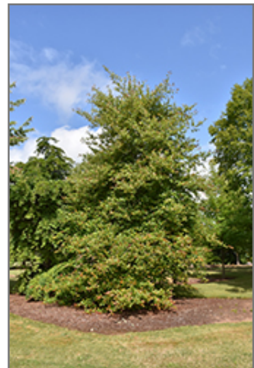
Wildfire Black Gum