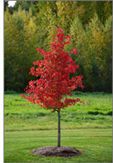
Wildfire Black Gum in fall