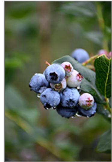
Chippewa Blueberry fruit

Chippewa Blueberry features dainty clusters of white bell-shaped flowers with shell pink overtones hanging below the branches in mid spring. It has green foliage throughout the season. The glossy oval leaves turn an outstanding orange in the fall. It features an abundance of magnificent blue berries in mid summer.