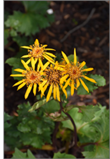
Osiris Cafe Noir Rayflower flowers