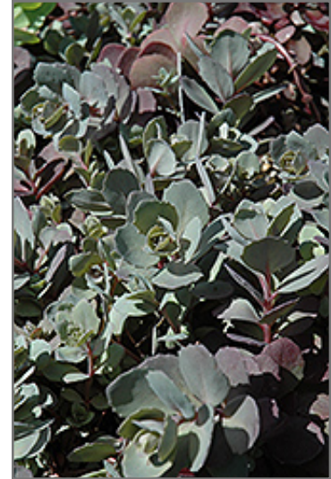
Dazzleberry Stonecrop foliage

Dazzleberry Stonecrop is a fine choice for the garden, but it is also a good selection for planting in outdoor pots and containers. It is often used as a 'filler' in the 'spiller-thriller-filler' container combination, providing a mass of flowers and foliage against which the larger thriller plants stand out. Note that when growing plants in outdoor containers and baskets, they may require more frequent waterings than they would in the yard or garden.