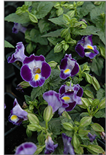
Catalina Midnight Blue Torenia flowers