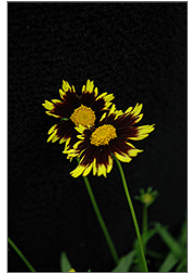
Cosmic Eye Tickseed flowers

Cosmic Eye Tickseed is recommended for the following landscape applications;